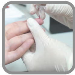
Blood sample from fingertip