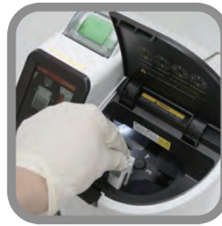
Put cartridge into the device