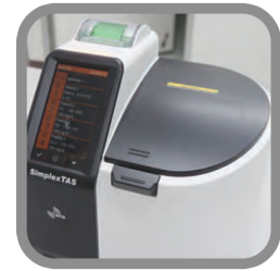
Close lid and test starts automatically